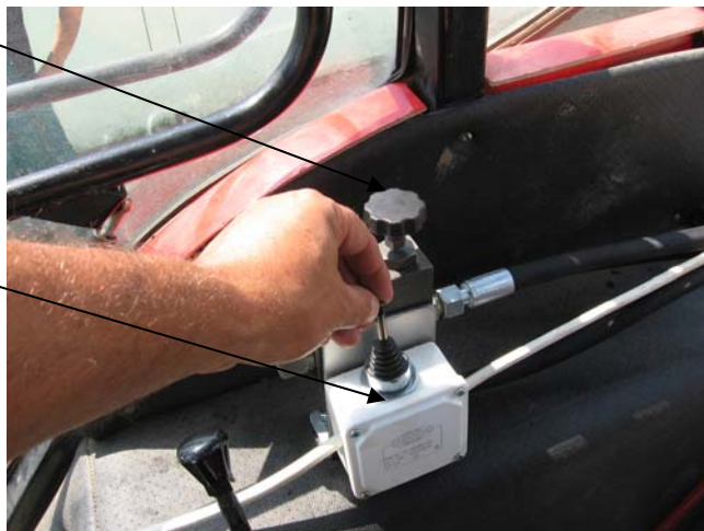
Control from the cabin

Manual steering through joystick. Electrical driving of 12V to an electromagnetic distributor.