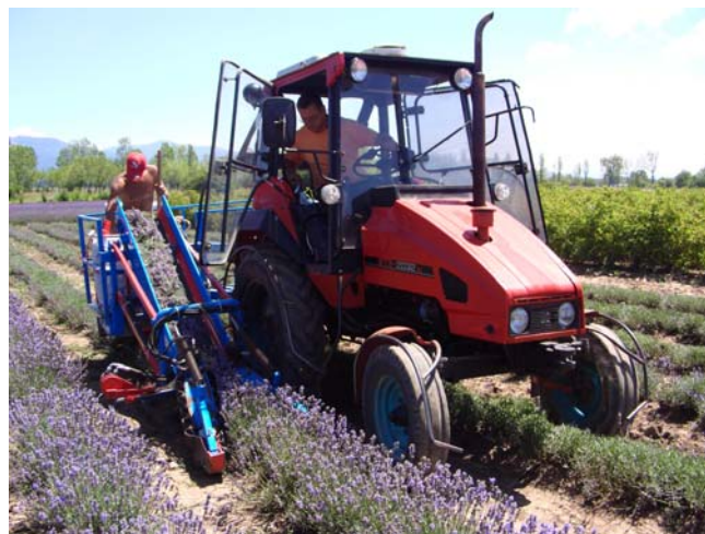
MKL- 2 in operation